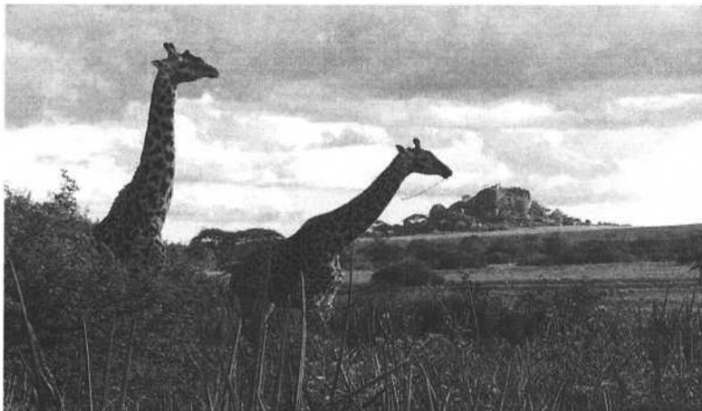
< Giraffes, with Olduvai Camp in the background

The Olduvai Gorge , a 50-km long ravine, is one of the most important prehistoric sites in the world, and has provided a major contribution to the understanding of early human evolution. Millions of years ago, it was inhabited by early species of humans, such as ashomo habilis and homo erectus . Olduvai is therefore known as “The Cradle of Mankind”, ( http://en.wikipedia.org/wiki/Olduvai_Gorge .)