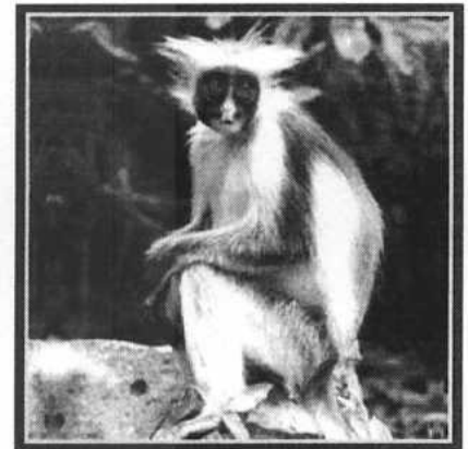
Den izen of the Joz ani For

Breakfast followed by a transfer to Stone Town, capital of Zanzibar with a unique blend of Moorish, Middle Eastern, Indian, and African traditions and architectures, and a UNESCO World Heritage Site. Guided walking tour of the old town, the waterfront, and the harbor, with sights such as the Arab Fort and the old Slave Market followed by free time for lunch. In the afternoon, transfer to airport for short flight to Dar Es Salaam for dinner and check in for your return flight to Toronto.