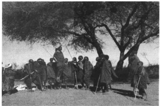
In the Maasai Village >

Two-day safari in Tarangire National Park, the greatest concentration of wildlife outside the Serengeti ecosystem, and famous for its rare antelopes, such as the kudu, the oryx and the gerenuk - a smorgasbord for predators! Picnic lunch on both days, and dinner and overnight in the small but exquisite Tarangire River Camp , located on a hilltop.