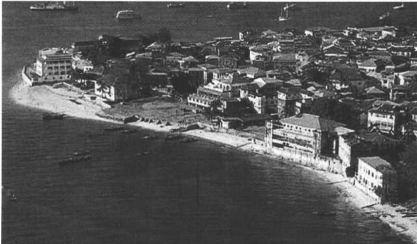
< Zanzibar's capital, Stone Town

Departure from the hotel after breakfast. We're off on a "spice tour" of this "spice island," one of the few places in the world where saffron and many other Middle Eastern/Asian spices such as cardamom, ginger, cloves, nutmeg, etc. are grown, including visits to some the beautiful plantations. Also visit to the Jozani Forest , featuring some very exotic (and large) trees and ferns and other tropical types of vegetation and inhabited by a native species of monkeys, the Red Colobus, now nearly extinct. Return to hotel.